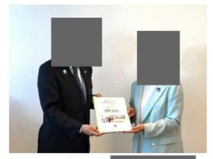
Meeting with UN Under-Secretary-General and High Representative for Disarmament Affairs (June 2022, Vienna)