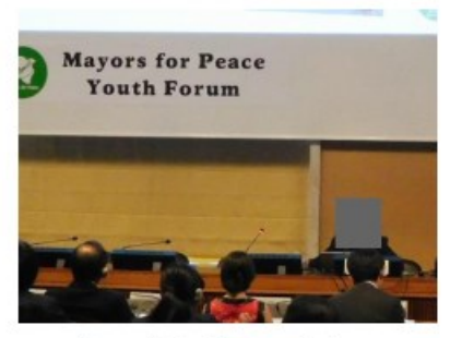
Presentation by a youth from a member city at the Mayors for Peace Youth Forum held in UNOG (April 2018, Geneva)