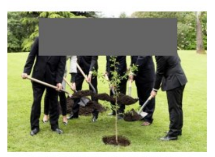
Planting ceremony of a second generation atomic-bombed Ginkgo seedling by a member city (April 2018, Guernika-Lumo)