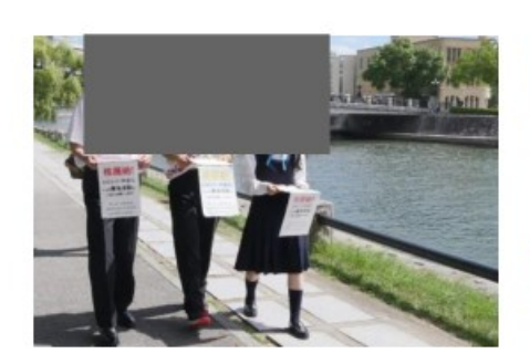
Petition Drive by the President and high school students in the street (August 2022, Hiroshima)