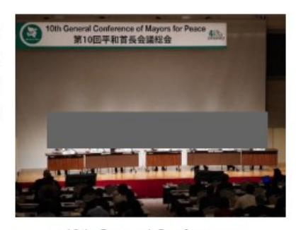
10th General Conference (October 2022, Hiroshima)

Mayors for Peace holds an Executive Conference generally once every two years in one of the executive cities, where executives discuss future initiatives and plans for the next General Conference.