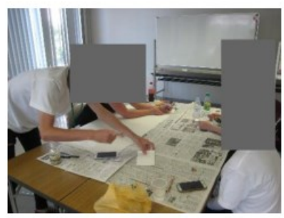
Discussions at the Mayors for Peace Youth Exchange for Peace: Support Program for "HIROSHIMA and PEACE" by youths from member cities (August 2019, Hiroshima)